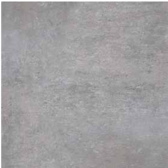
GCT 0A6 CEMENT DARK 61,5X61,5