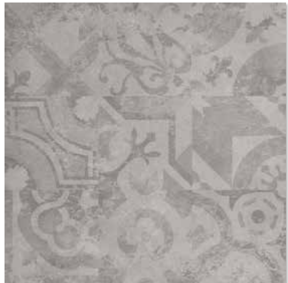
GCT 1A3 CEMENT MID DECOR CEMENTINE 61,5X61,5