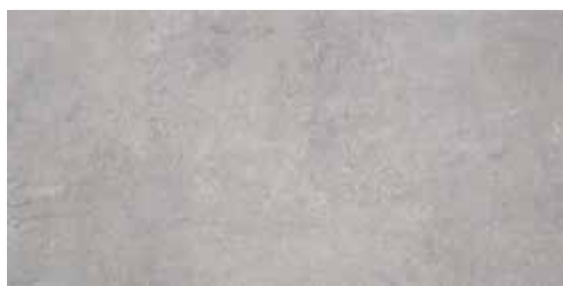
GCT 0C3 CEMENT MID 30,8X61,5 ■ 16