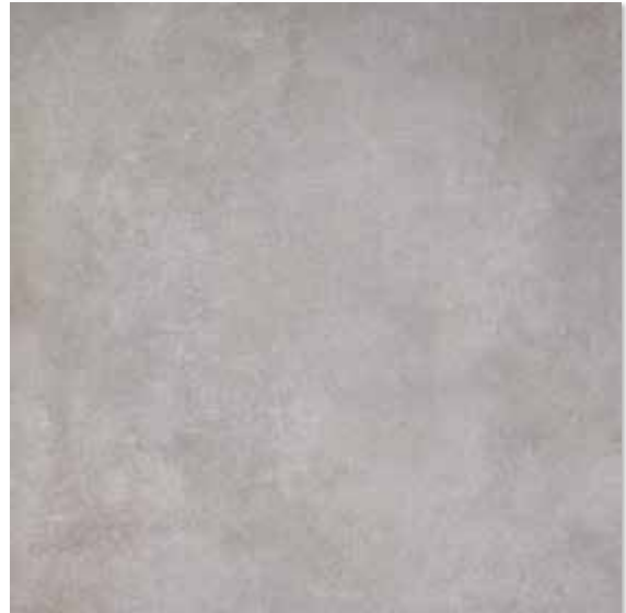
GCT 0A3 CEMENT MID 61,5X61,5