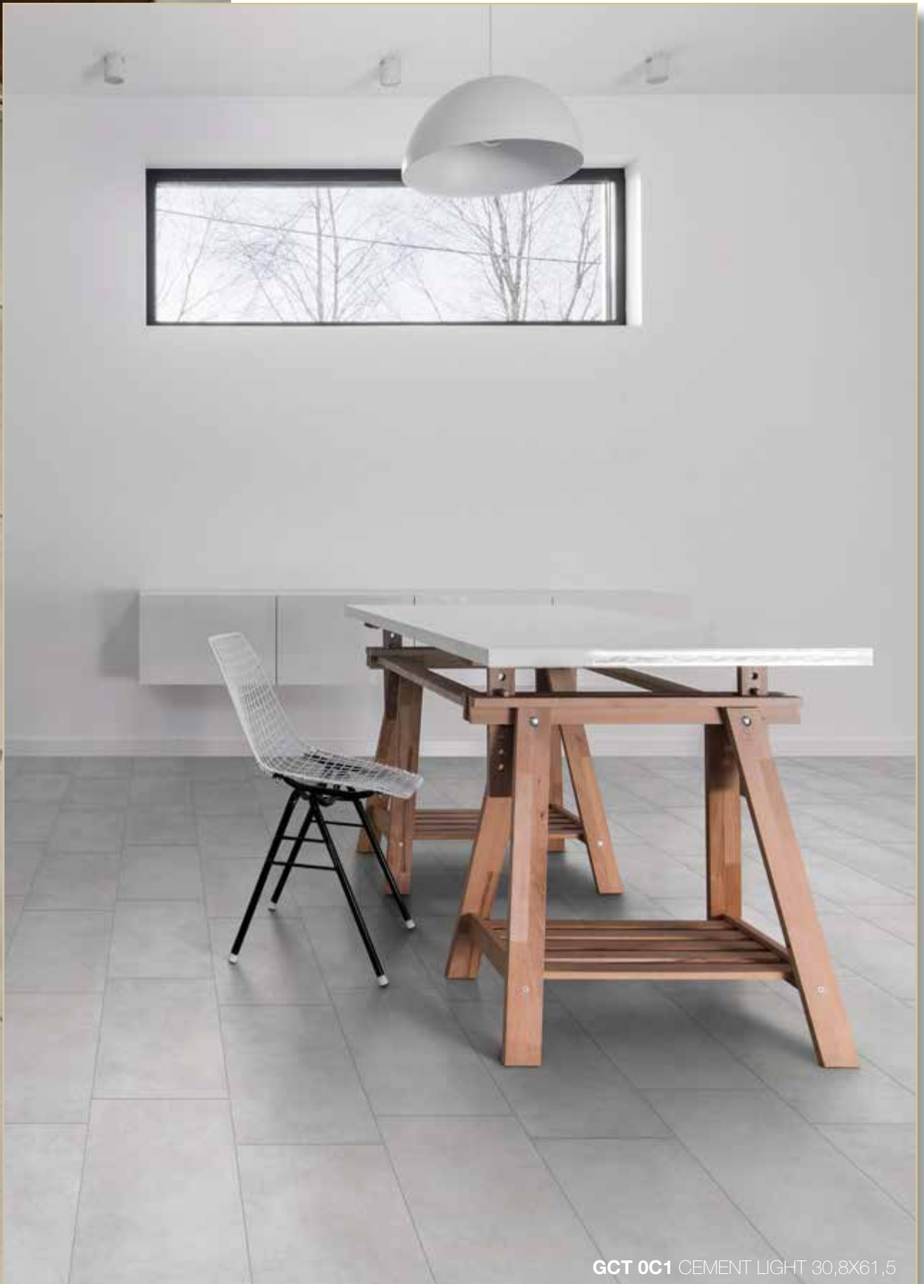
GCT 0C1 CEMENT LIGHT 30,8X61,5