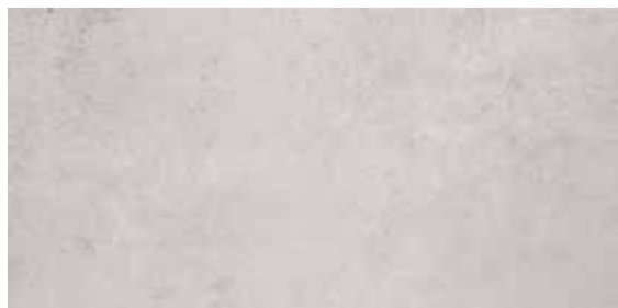
GCT 0C1 CEMENT LIGHT 30,8X61,5 ■ 16