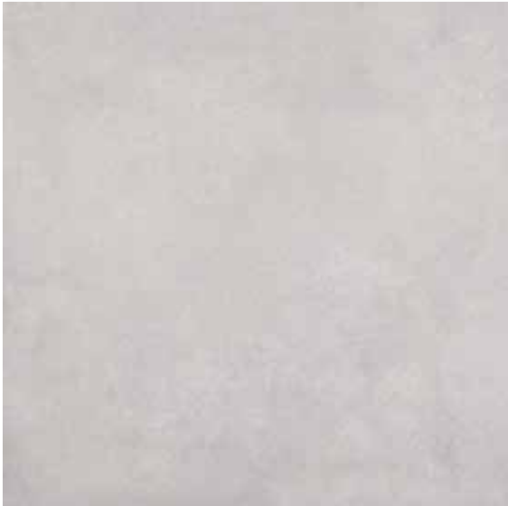
GCT 0A1 CEMENT LIGHT 61,5X61,5