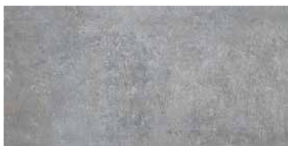
GCT 0C6 CEMENT DARK 30,8X61,5 ■ 16